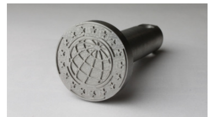
Example of a generic tactile impression die.

The tactile impressor feature, designed exclusively for use in the Datacard® SD460™ card printer and CD800™ card printer with inline lamination module, offers an affordable and entry-level security feature ideal for any card program. This patent-pending feature utilizes a mechanical die within the laminator that physically impresses a generic or custom design directly onto the card substrate and overlay or patch laminate in the same pass. The final output is a card with added counterfeiting and tampering resistance that will impress any cardholder.