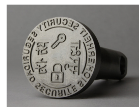
.9 in. (22.86 mm) Security Design