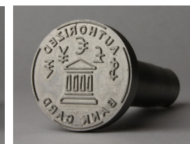
.9 in. (22.86 mm) Bank Design