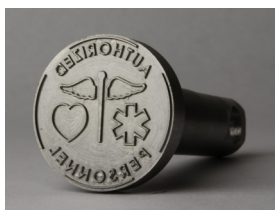
.9 in. (22.86 mm) Medical Design