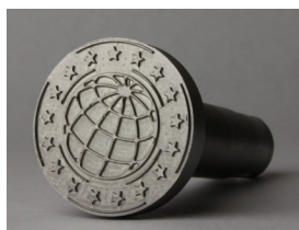
.9 in. (22.86 mm) Global Design