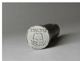
.5 in. (12.7 mm) Education Design