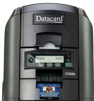
Datacard® CD800™ Series Card Printer