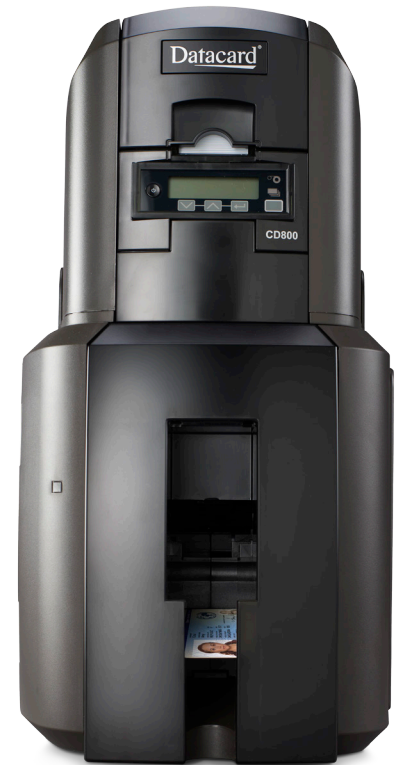
Datacard® CD800™ Card Printer with inline lamination module