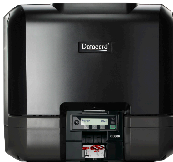
Datacard® CD800™ Card Printer with optional multi-hopper